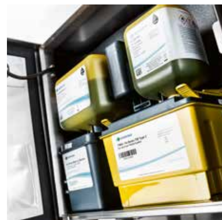
▶ Ink and make-up cartridges and i-Tech Filter Module – all with RFID control